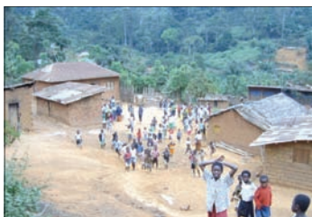
Habitat : Kinf of squatters'area