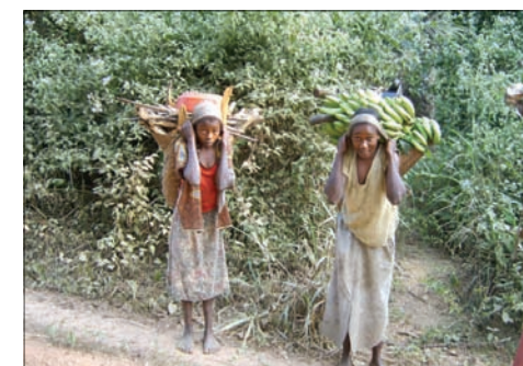
Women: inhuman condition of work