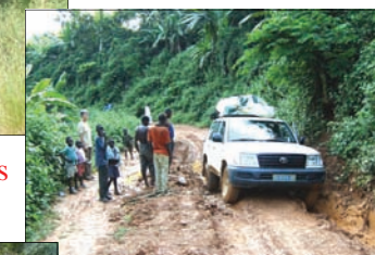
80% of routes are in bad condition