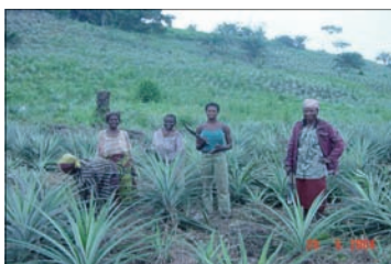
Plantation of pineapple