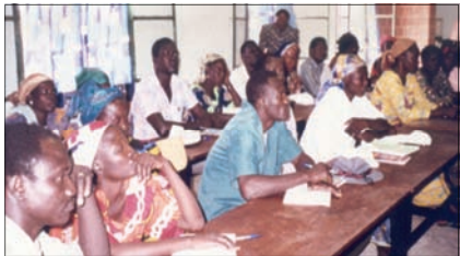
Great need of formation of lay leaders