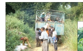
Track: Lack of means of transportation