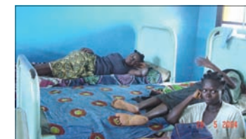
60% no access to health services: lack of services and too expensive