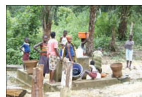
Potable water far from the villages